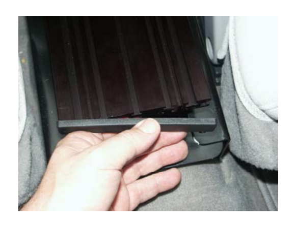
<u>Tighten all loose hardware.</u> <u>Insert necessary hardware for consoles and accessories and attach plastic end caps</u>